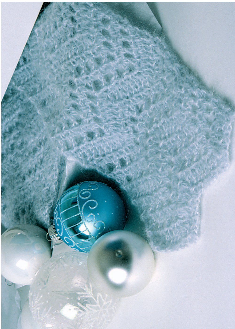
Pattern for personal use only. Do not reproduce without permission.